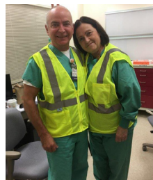
Interventional Radiology team members